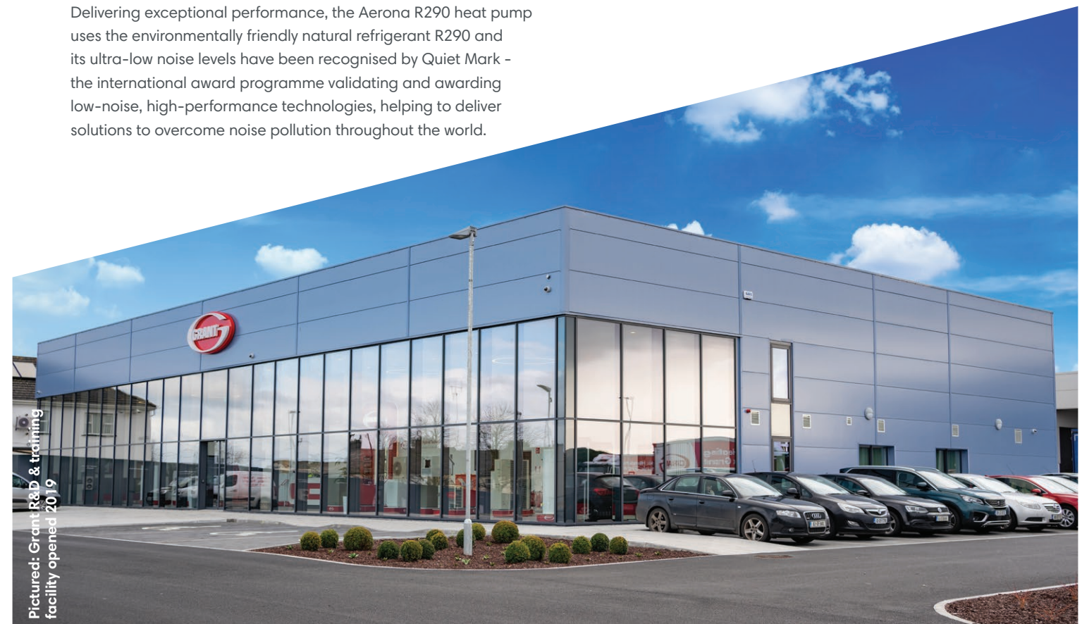
Pictured: Grant R&D & training facility opened 2019