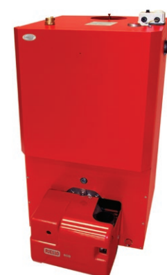
Grant Vortex boiler house 46/70kW model