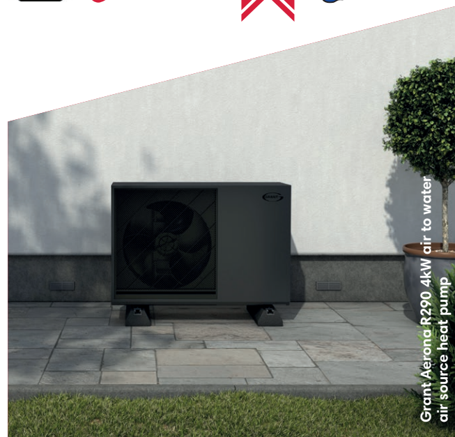
Grant Aeron R290 4kW air to water air source heat pump