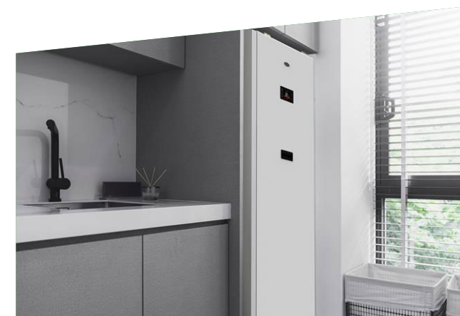
Grant Quick Recovery Smart Integrated 210 litre cylinder

Highly versatile, the Quick Recovery cylinders are designed specifically for use with air to water air source heat pump systems and are suitable for multi-zone heating systems, including domestic hot water.