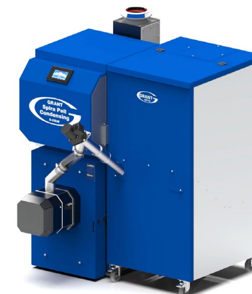
Spira Pell 9-33kW Condensing wood pellet boiler

Utilising indigenous wood pellets, these are truly an environmentally friendly heating solution, with outputs from 5 to 33kW.