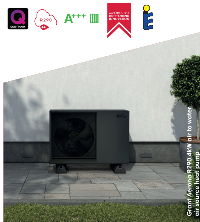
Grant AERONA R290 4kW air to water air source heat pump

The energy source used by heat pumps can also be entirely renewable, so by installing a heat pump the carbon footprint of the property is immediately reduced.