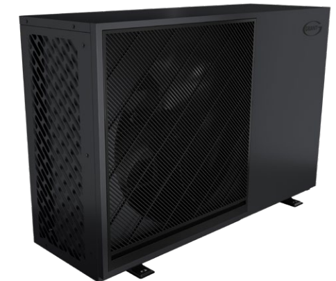
4kW Grant Aerona R290 air to water air source heat pump

Delivering exceptional performance, the Aerona R290 heat pump uses the environmentally friendly natural refrigerant R290 and its ultra-low noise levels have been recognised by Quiet Mark - the international award programme validating and awarding low-noise, high-performance technologies, helping to deliver solutions to overcome noise pollution throughout the world.