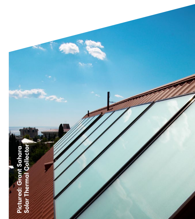
Pictured: Grant Sahara Solar Thermal Collector

Utilising indigenous wood pellets, these are truly an environmentally friendly heating solution, with outputs from 5 to 33kW.