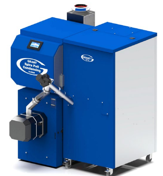
Spira Pell 9-33kW Condensing wood pellet boiler