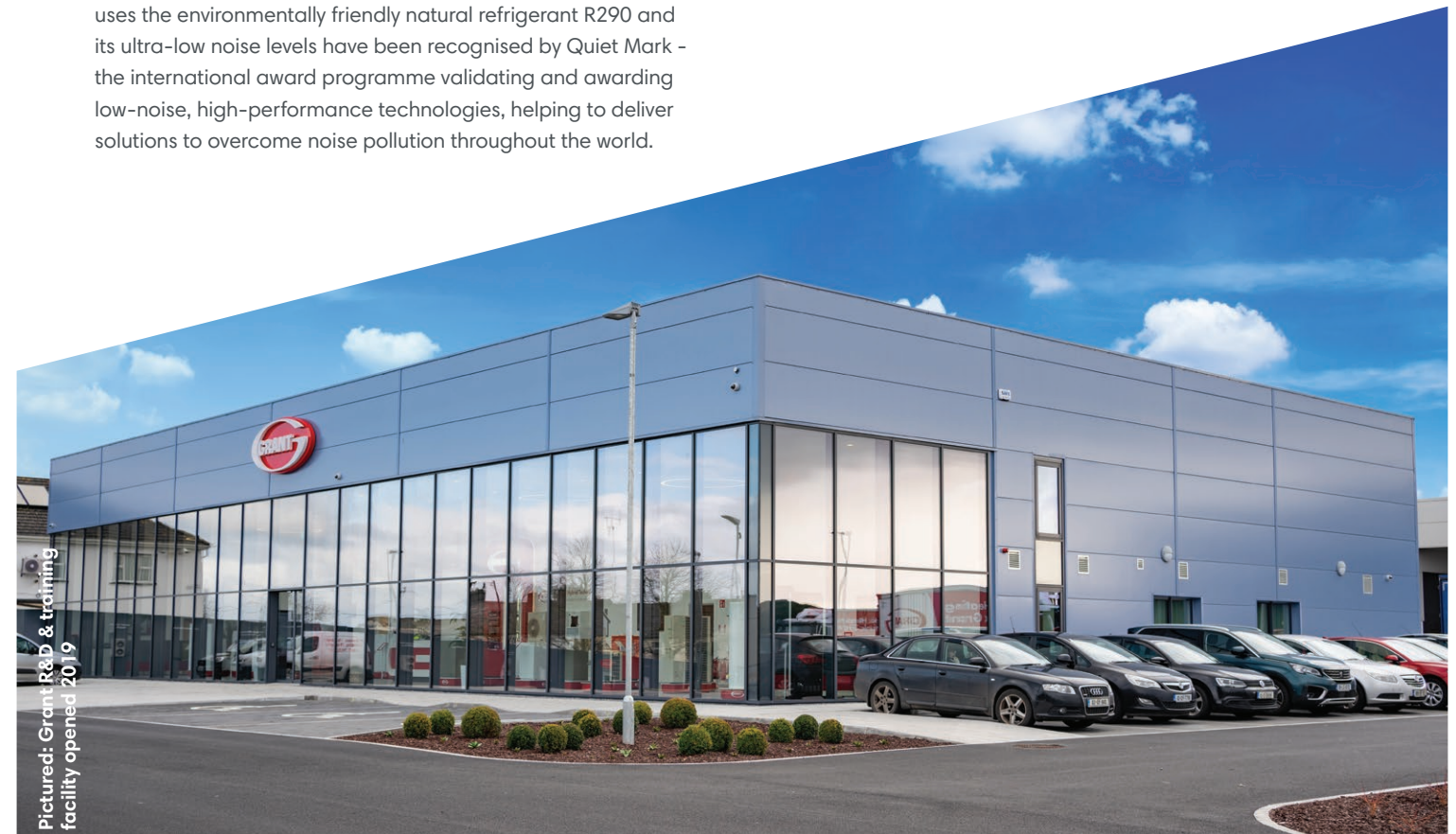
Pictured: Grant R&D & training facility opened 2019