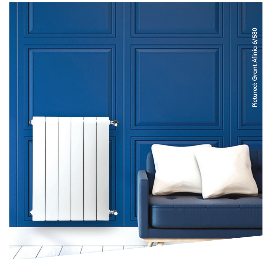
Pictured: Grant Afinia 6/580

Aluminium radiators, such as the Grant Afinia, offer high efficiency and are compatible with both high and low temperature systems. They feature excellent conductivity and, with vertical and horizontal combinations available, deliver flexibility with installations.