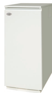
Grant Vortex utility 26kW model

Existing Grant Vortex condensing boilers are future-proofed to use HVO biofuel through making a slight modification to the boiler. This can be carried out by your local plumber or installer.