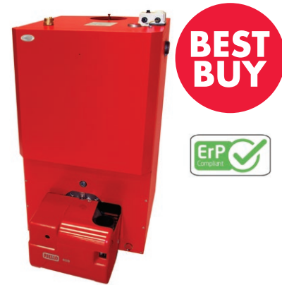
Grant Vortex boiler house 46/70kW model