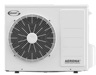
*13kW & 17kW

In addition, Grant's A+++ Aerona<sup>3</sup> R32 13kW and 17kW air source heat pumps have also recently been recognised by Quiet Mark for their quiet operation. Quiet Mark is the international award programme validating and awarding low-noise, high-performance technologies, helping to deliver solutions to overcome noise pollution throughout the world.